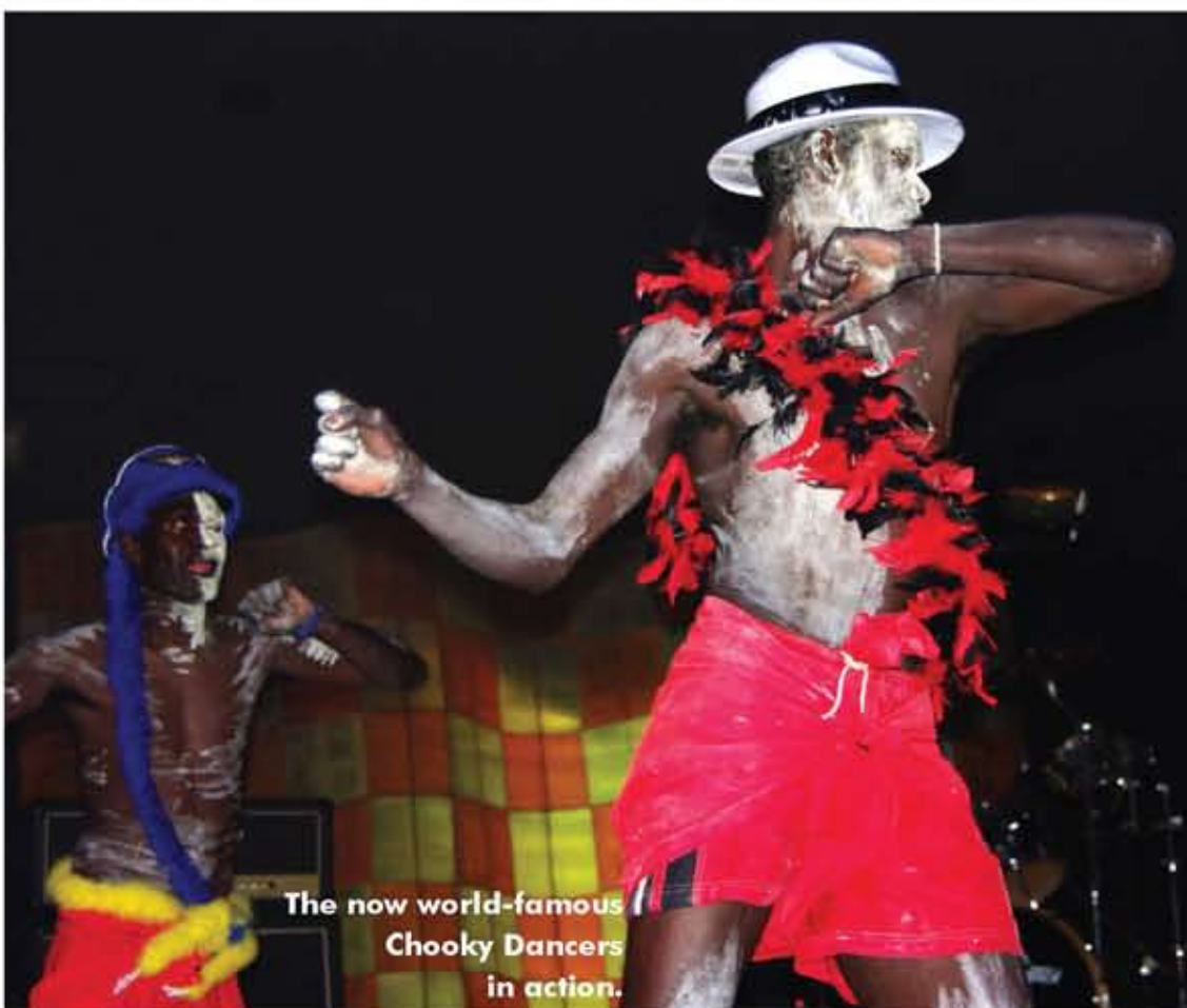
The now world-famous Chooky Dancers in action.