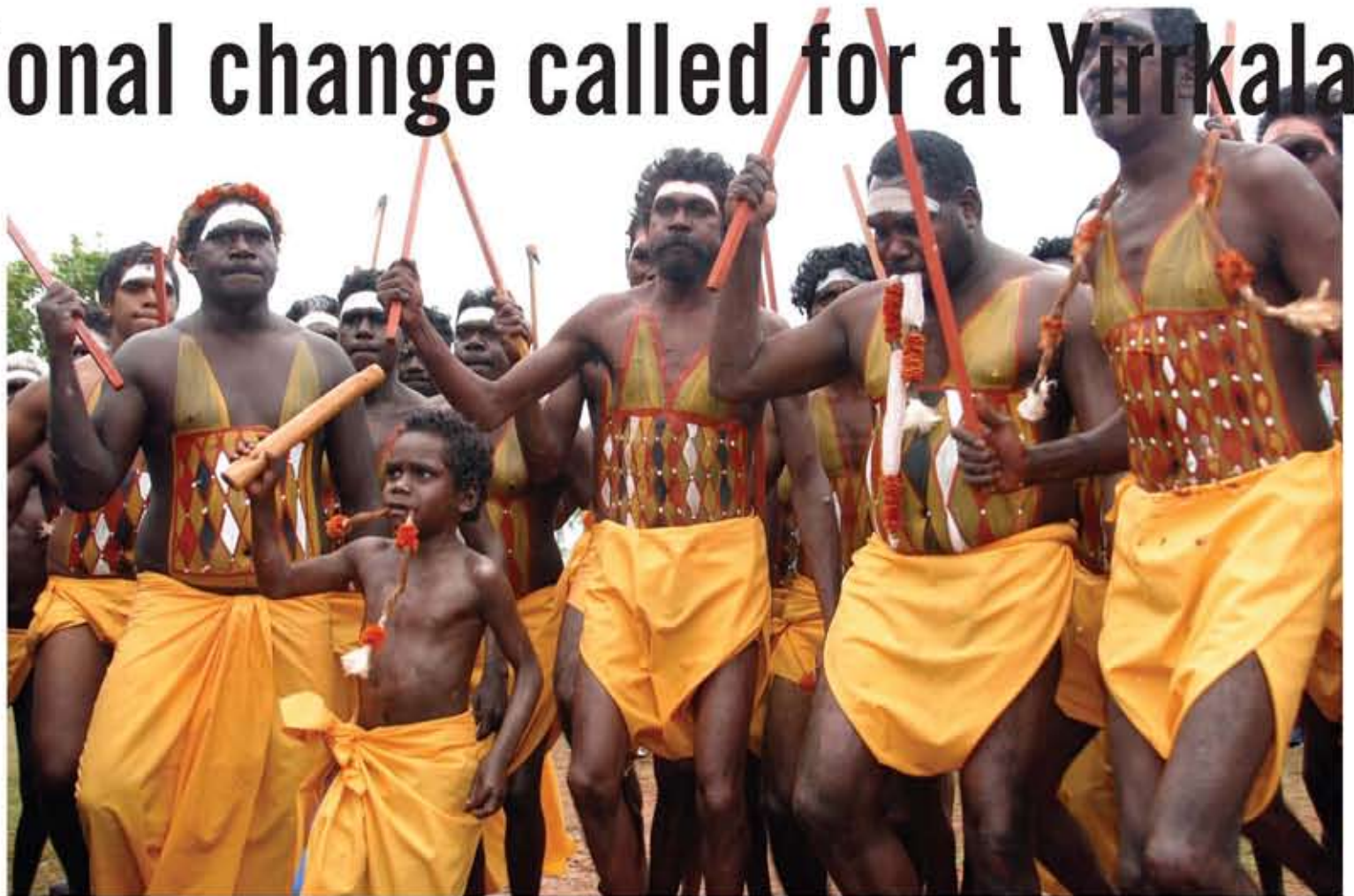
Yolngu dancers conduct ceremony for the Prime Minister Kevin Rudd and his cabinet in Yirrkala.

Mr Rudd was also presented with a bark petition, by Gumatj