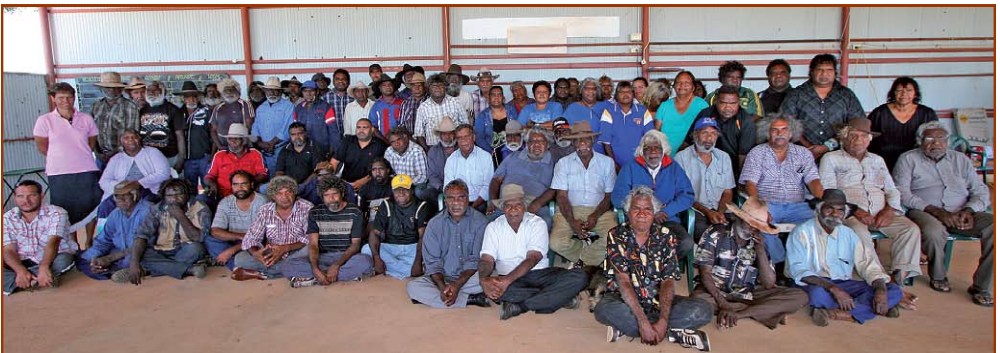
Above: The new CLC Council.