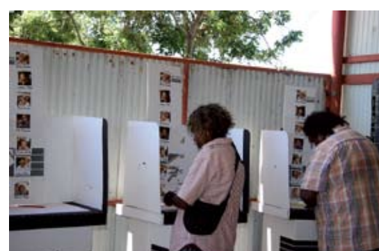
Left: Casting the votes in a tightly contested election for the Chairmanship of the CLC.