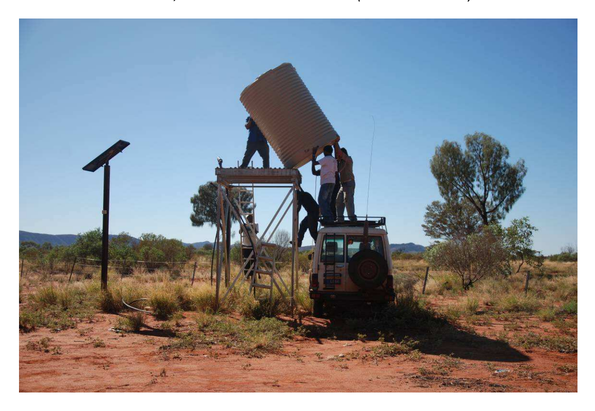
Getting the new tank up at Piyultjara

"Years ago traditional owners from Uluru-Kata Tjuta, they came up with the idea to start a community development project, and it's a good one. Because it's good to help other communities, small outstations and so on." (Traditional owner)