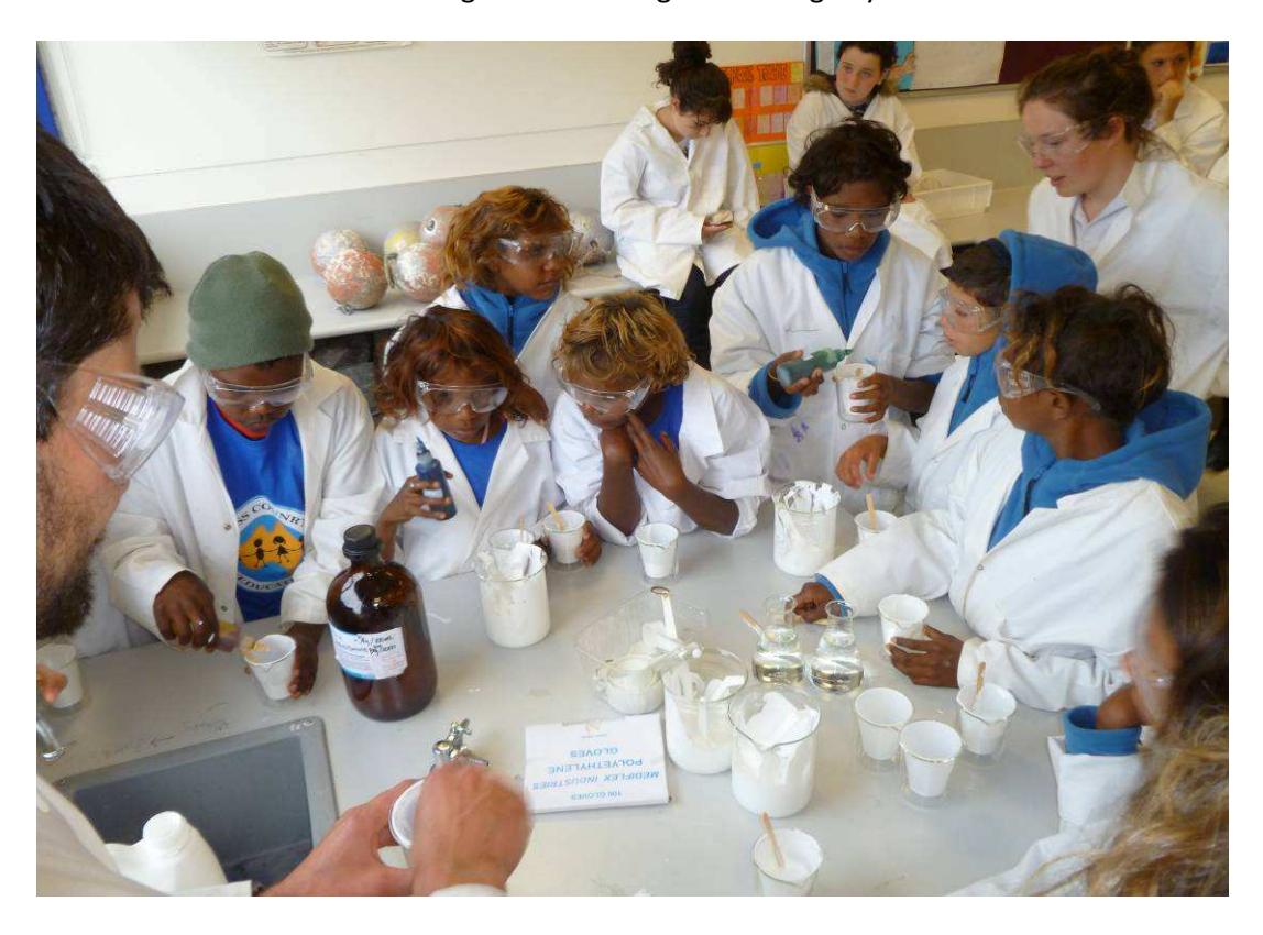
Nyirrpi students visit Rosebud Secondary College and participate in a science class

These two projects focus on enabling young people to develop their skills and capabilities across both cultures. On one hand the projects increase the exposure of young people to mainstream culture and provide opportunities to learn to live confidently within that culture. For example in 2010 school excursions were undertaken from the schools at Nyirrpi, Lajamanu and Yuendumu to Melbourne and the snowfields, with children visiting sporting and educational sites as well as learning how to manage within big city environments.