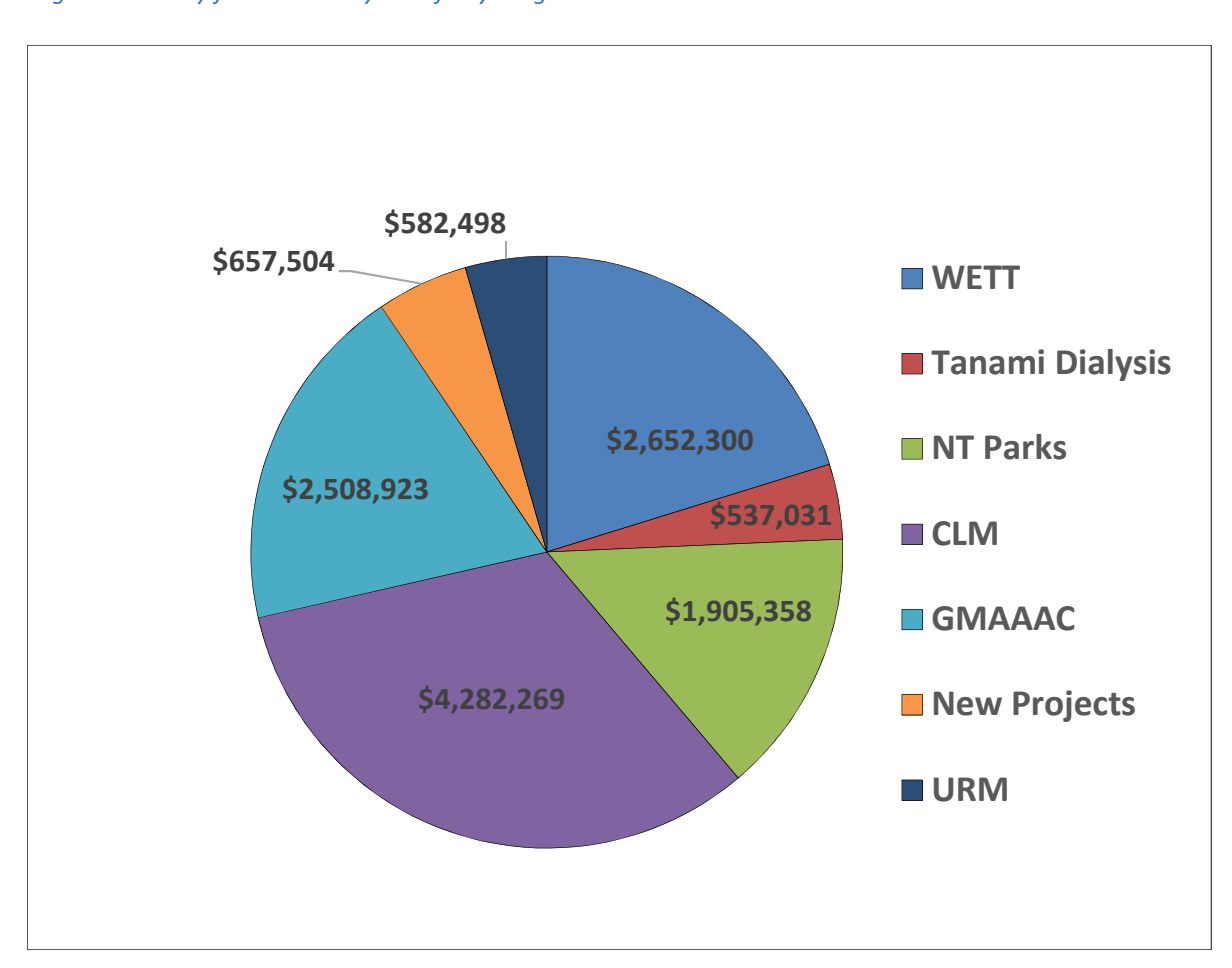
Figure 2: Money for Community Benefit by Program 2015

In 2015, the total money made available by Aboriginal people for the development of their communities totalled $13,125,884 (allocated across programs as illustrated in Fig 2.). This compares to $11,977,019 for 2014, showing a growing amount of Aboriginal-owned resources being allocated to community benefit activities.