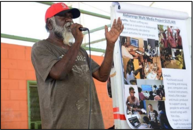
Figure 16: Performers at the Alekarenge Dance Festival