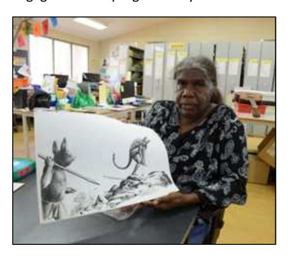
Figure 7: Barbara Martin's sketch for a BRDU resource

There is an active subcommittee supporting this program and young people from the subcommittee engage with the program daily to monitor activities and suggest possible improvements.