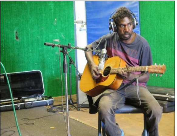
Figure 13: The Willowra Lander River Band practicing with their music and recording equipment

In particular people were supportive of money for sorry business.