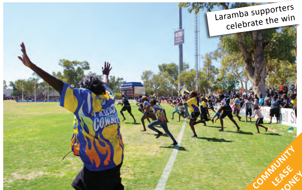
Laramba supporters celebrate the win