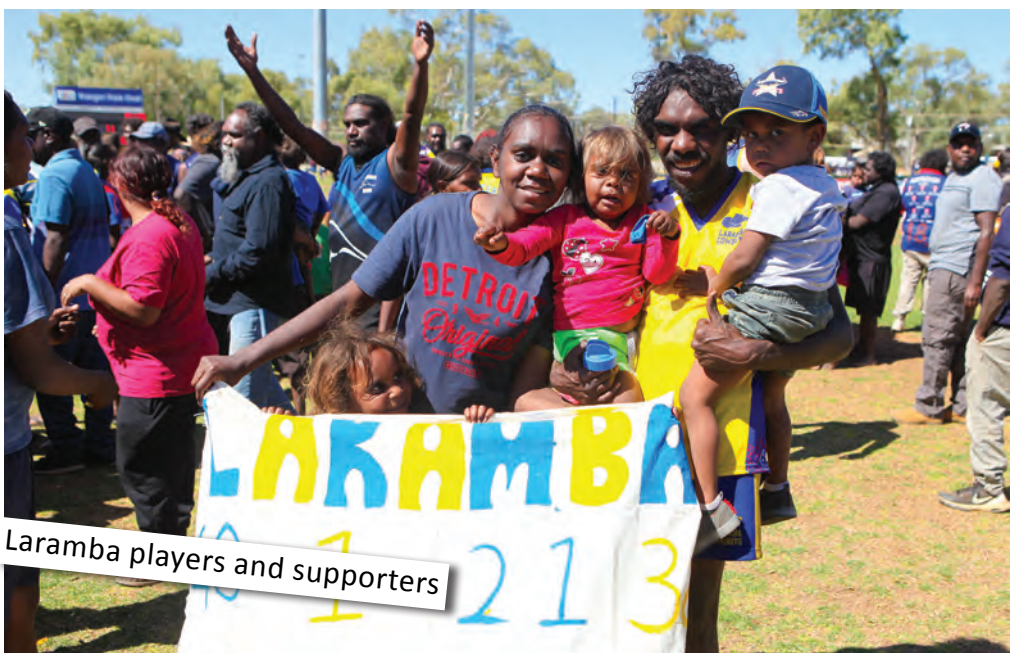
Laramba players and supporters