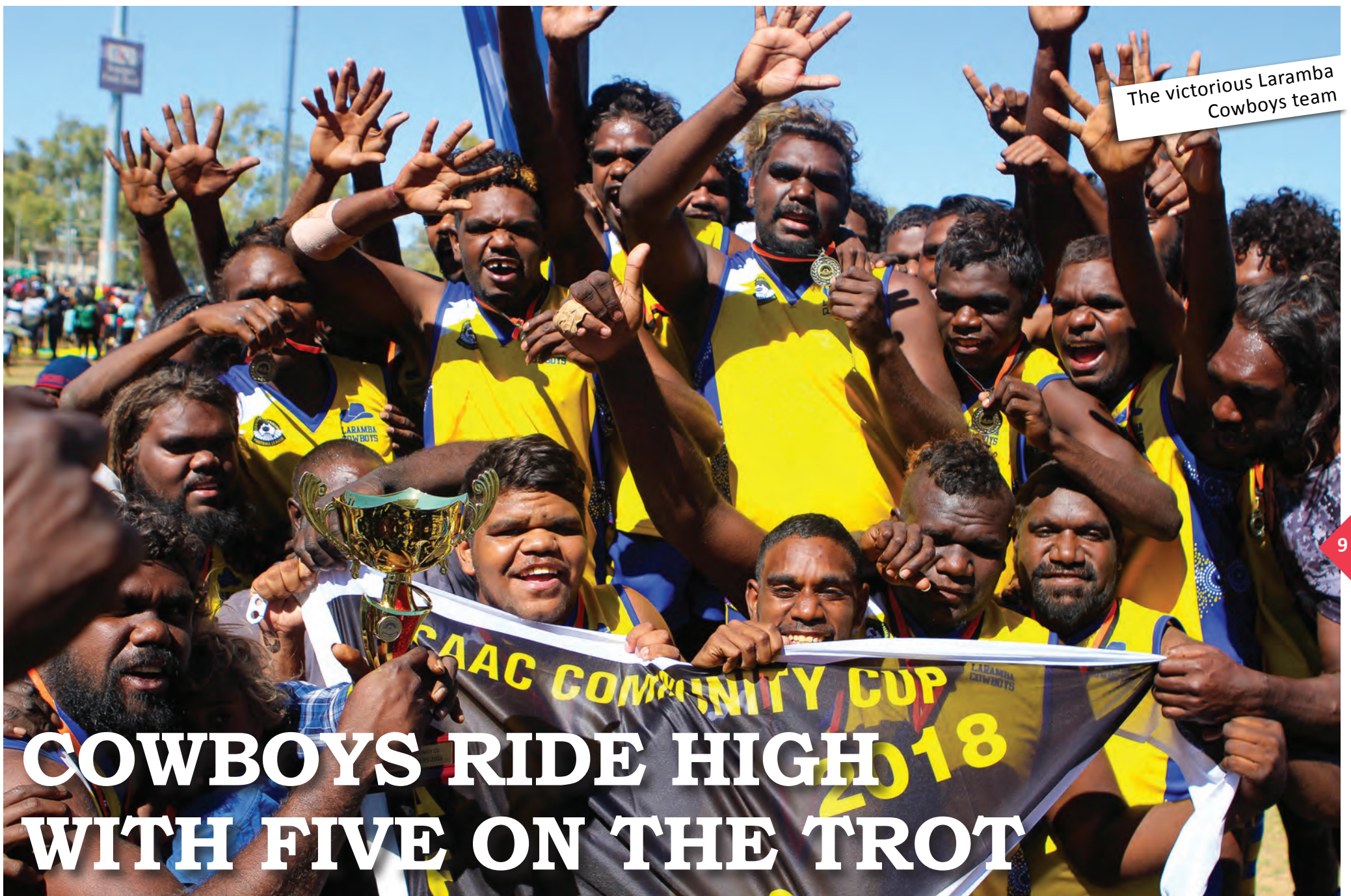
The victorious Laramba Cowboys team