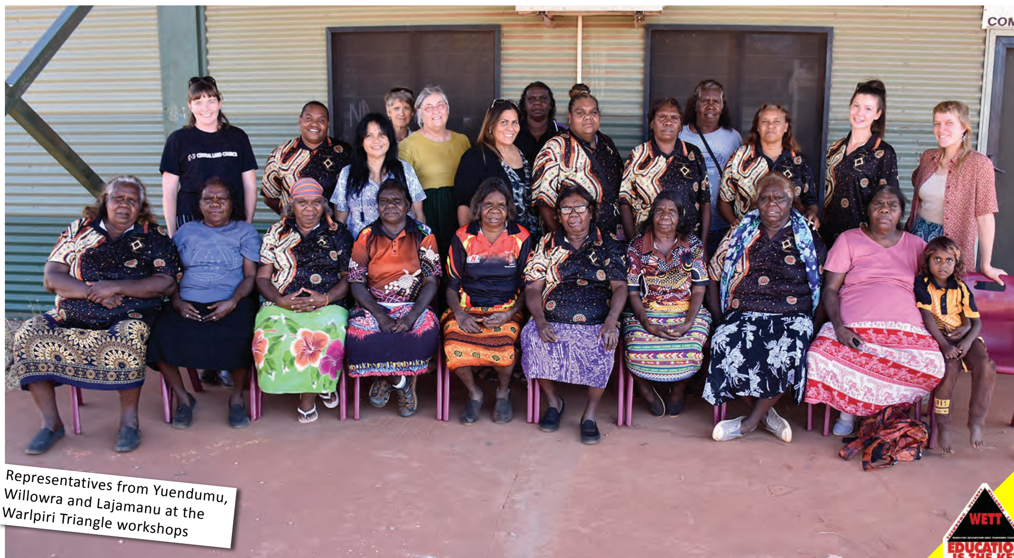
Representatives from Yuendumu, Willowra and Lajamanu at the Warlpiri Triangle workshops

The WETT is also investing $100,000 in a project to further develop the Warlpiri Theme Cycle to help all Warlpiri schools teach a strong Yapa curriculum. The project also aims to strengthen support from the NT Department of Education for bilingual education.