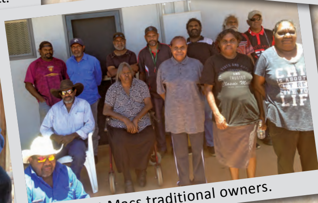
East Macs traditional owners.