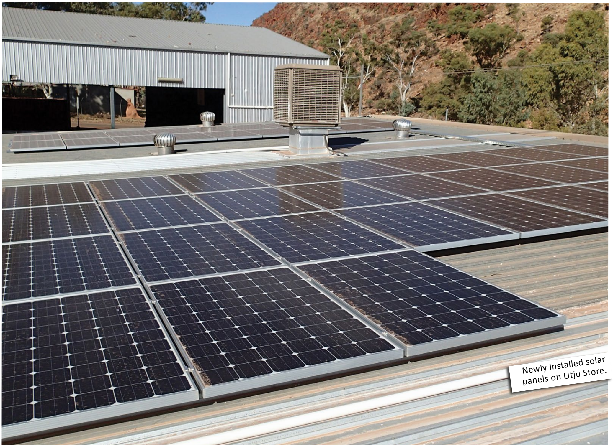
Newly installed solar panels on Utju Store.

Ongoing repairs and maintenance costs will be paid for from store income.