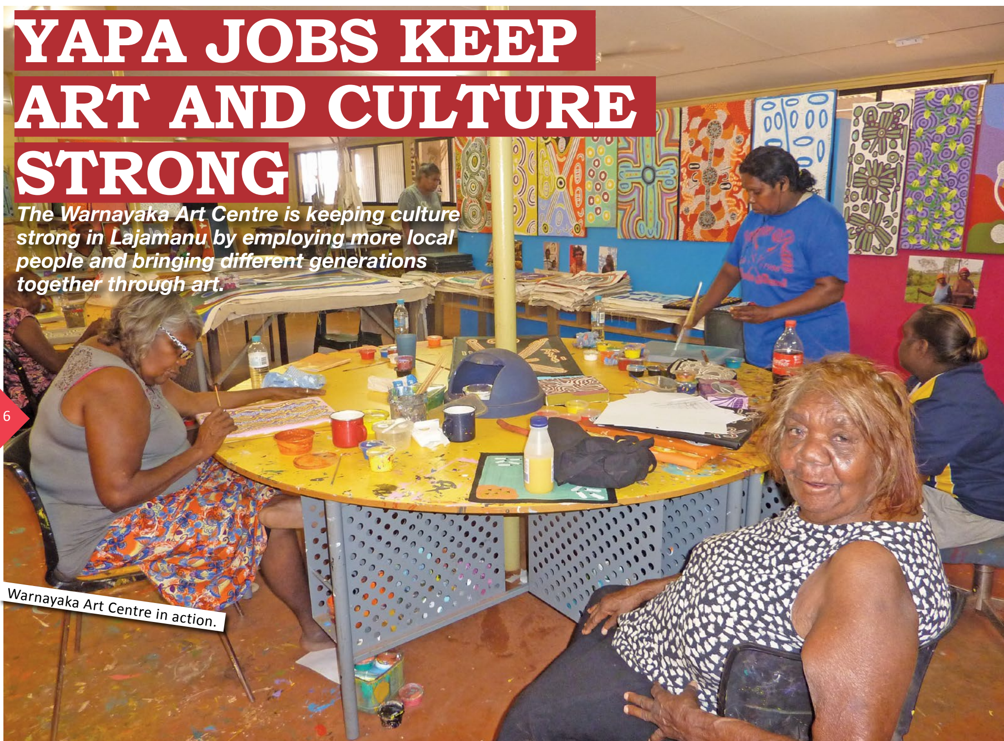
Warnayaka Art Centre in action.

GMAAAC funding is paying for up to five Yapa casual art centre assistants who fill in when other staff are away and during busy periods. They do a wide range of jobs from database management to caring for artists and sometimes travel to art fairs and exhibitions in Australia or overseas. The employees are learning a range of useful skills and helping the Art Centre to grow and continue to support Warlpiri culture.