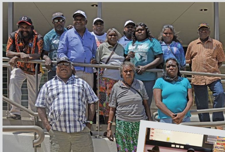
GMAAAC Directors meet in Alice Springs to represent the GMAAAC Committees