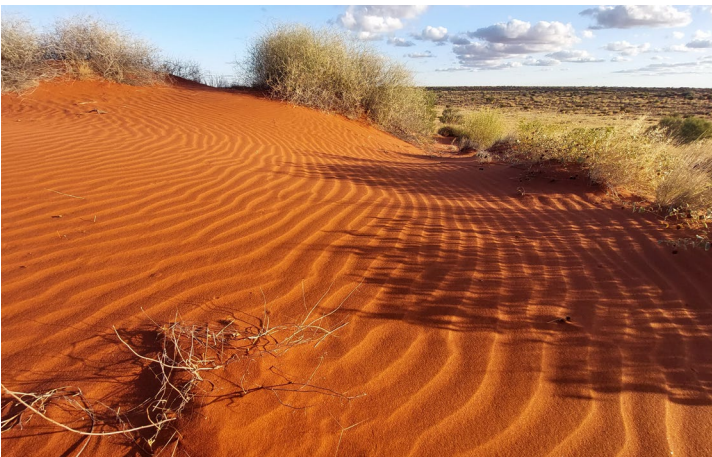
Dunefields at Madigan.

They also face great challenges when it comes to visiting, looking after, working and living on their country.