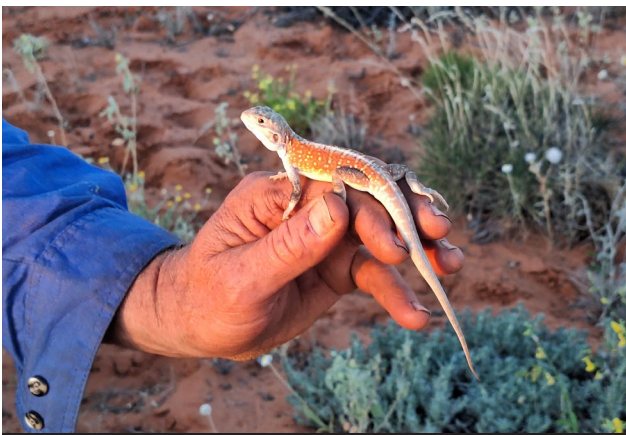
The central-nettled dragon, taken at a fauna survey on the Pmer Ulperre Aboriginal Land Trust in 2023.