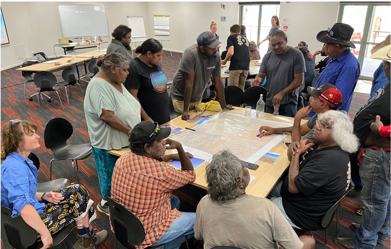
Traditional owners for the Simpson Desert area and the three Aboriginal land trusts in this area discuss a potential IPA in 2023.

Three traditional owner committees advise the CLC's Aputula, Ltyentye Apurte and Akityarre ranger groups. These groups predate the IPA agreement and each have their own area of operation in, near and outside the IPA. The agreement allows the CLC to employ additional rangers and support officers. The CLC will administer the IPA and employ an IPA coordinator.